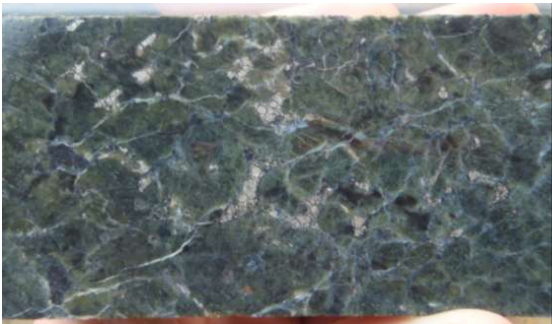
Figure 3. Disseminated pyrrhotite-pentlandite in MTD001 at 154 m that indicate a magmatic sulphide origin.