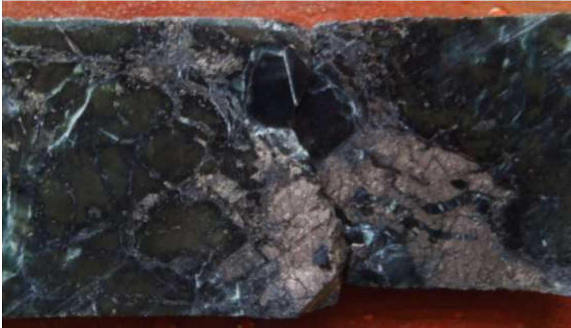
Figure 2. Layer of massive pyrrhotite-pentlandite in diamond drill core from 210 m in Hole Hole MTD003. The core is about 10 cm wide.