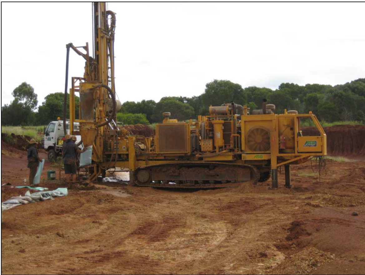
RC Drilling at the Edge – Greenvale Mine Site