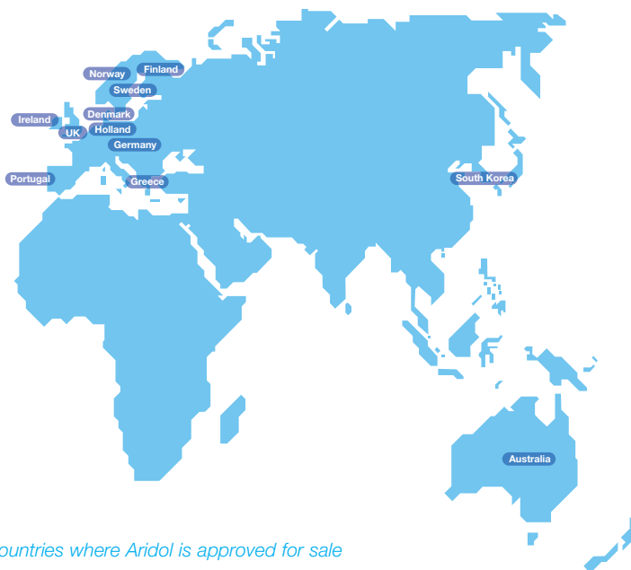
Countries where Aridol is approved for sale

the office-based physician market before launching with a local distributor. These latest approvals help position Aridol as the worldwide standard for detecting sensitive airways in people with conditions like asthma.