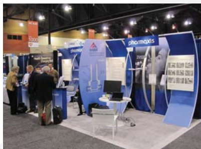
Pharmaxis presentation at major US conference

Bronchitol is currently supplied on a compassionate use basis to people with bronchiectasis who have no alternative treatment options.