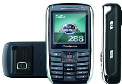
“Coolpad 288” Dual-mode Smartphones