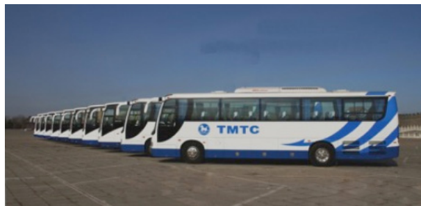
Passenger vehicles of TMTC

天馬通馳是本集團於2016年《環境、社會及管治報告》重點關注範疇，其主要業務包括：(i)向機構客戶僱員／學生提供穿梭巴士服務，以傳統能源汽車及／或電動巴士行走辦公地方／學校與不同的住宅社區之間；(ii)汽車租賃服務；及(iii)提供各種商務及休閒用途的汽車租賃服務，例如按機構或個人客戶要求提供接送服務。於2016年度，本報告以上述項目的三個環境範疇及八個社會範疇之政策及表現作披露。