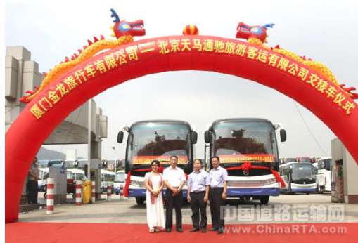
The Passenger Vehicle Delivery Ceremony between TMTC and the supplier Xiamen Golden Dragon Bus Co., Ltd.

本集團致力提供高標準的服務予用車客戶，包括投放資源改善車輛內外觀、配置的舒適性，以及提升車內空氣淨化設施的品質。今後選用環保車型更是整個社會的用車方向，所以天馬通馳已購置純電動客車進行試運營的規劃。