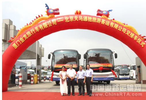
The Passenger Vehicle Delivery Ceremony between TMTC and the supplier Xiamen Golden Dragon Bus Co., Ltd.

本集團致力提供高標準的服務予用車客戶，包括投放資源改善車輛內外觀、配置的舒適性，以及提升車內空氣淨化設施的品質。今後選用環保車型更是整個社會的用車方向，所以天馬通馳已購置純電動客車進行試運營的規劃。