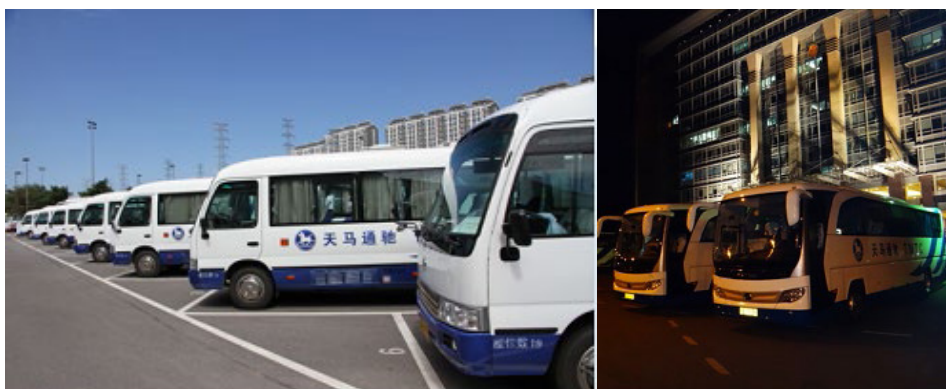
Passenger vehicles of TMTC (live shooting) 天馬通馳的客車 (現場實景拍攝)

天馬通馳是本集團於報告期間《環境、社會及管治報告》重點關注範疇，其主要業務包括：(i)向機構客戶僱員／學生提供穿梭巴士服務，以傳統能源汽車及／或新型電動巴士行走辦公地方／學校與不同的住宅社區之間；(ii)汽車租賃服務；及(iii)提供各種商務及休閒用途的汽車租賃服務等，例如可按照機構或個人客戶的要求提供指定時間及路線的接送服務。於報告期間，本報告以上述業務的4個環境保護範疇及8個社會責任範疇之政策及表現作披露。