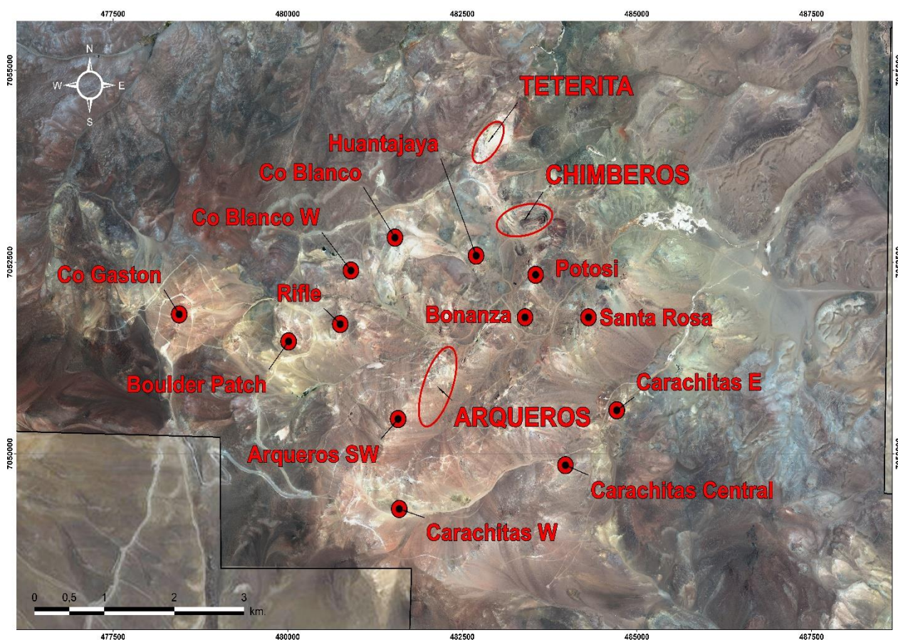
Figure 1: Nueva Esperanza target location map (Resource areas in caps)