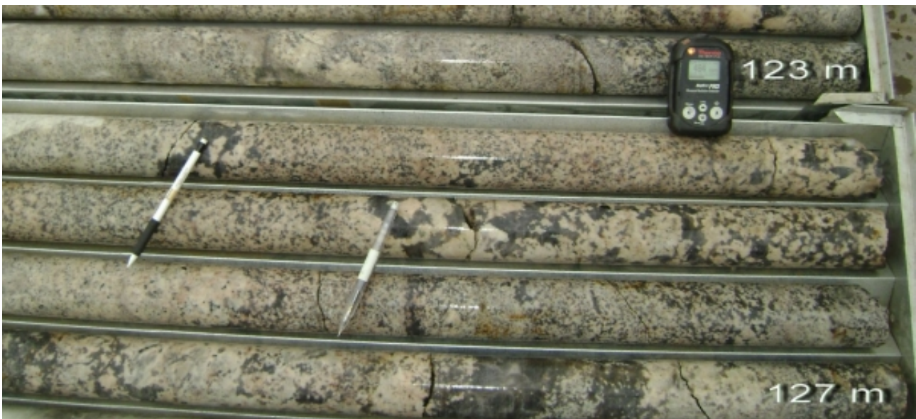
High grade alaskite mineralisation with smoky quartz in diamond hole ALAD001

The Ongolo mineralisation comes to within 20 metres of surface and underlies a broad, flat gently sloping sheetwash plain thinly veneered by gravelly alluvial and aeolian sands. The host rocks are mostly pelitic gneiss with variable but significant pyrite/pyrrhotite content, which may be important if sufficient to be recovered to support locally generated sulphuric acid production. The uranium mineral is primarily uraninite, and where present at grades of greater than 500 ppm, is marked by the presence of significant visible smokey quartz and, frequently, biotite.