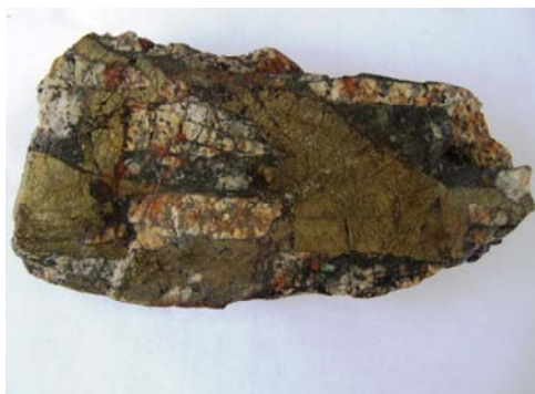
Chalcopyrite/Bornite mineralisation – Kumbruku Prospect