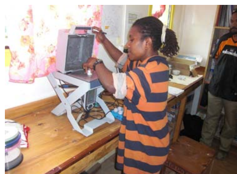
Niton XRF Analyser in operation at Yandera

www.marengominig.com www.irasia.com/listco/au/marengo