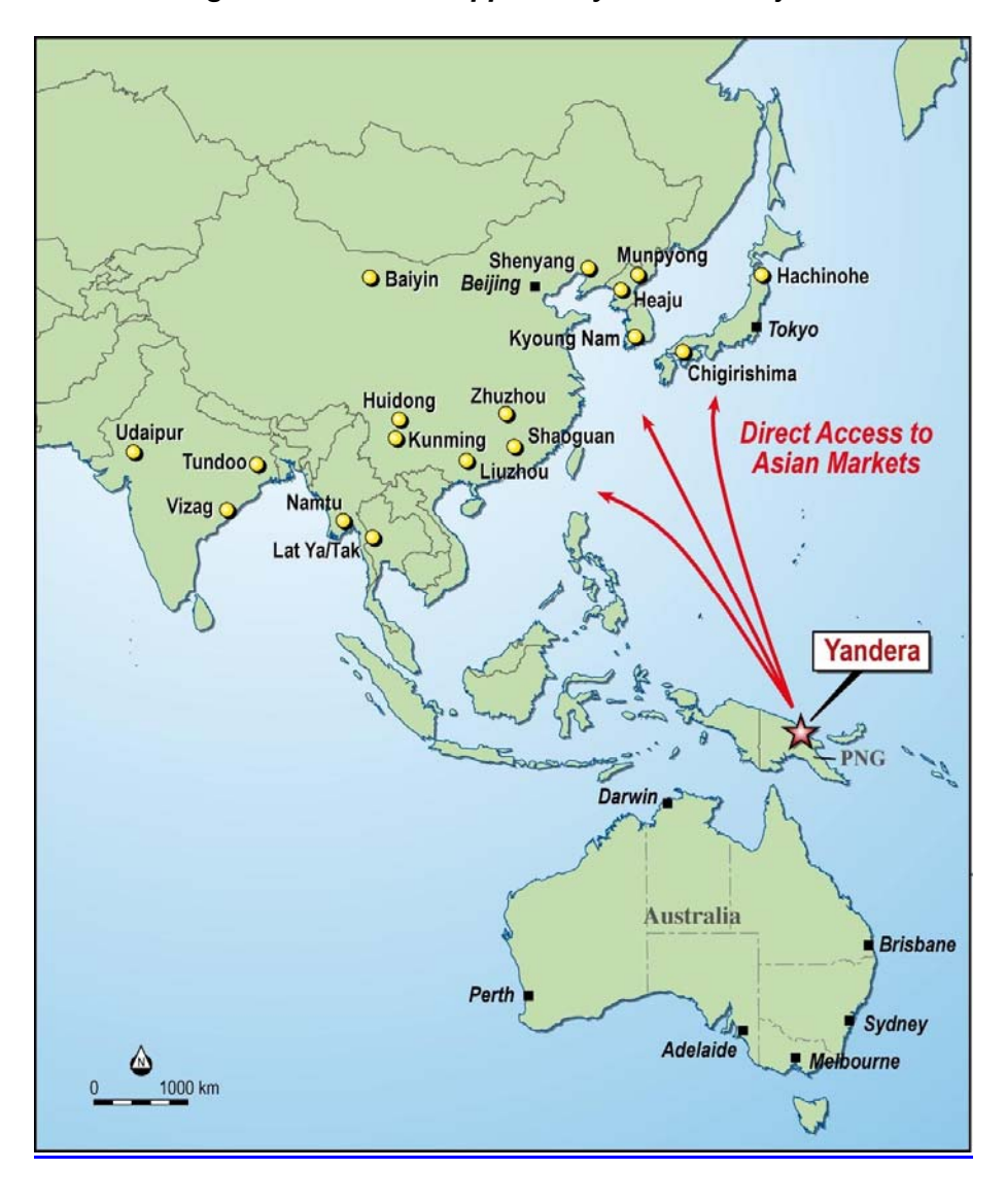
Figure 2: Yandera Copper-Molybdenum Project