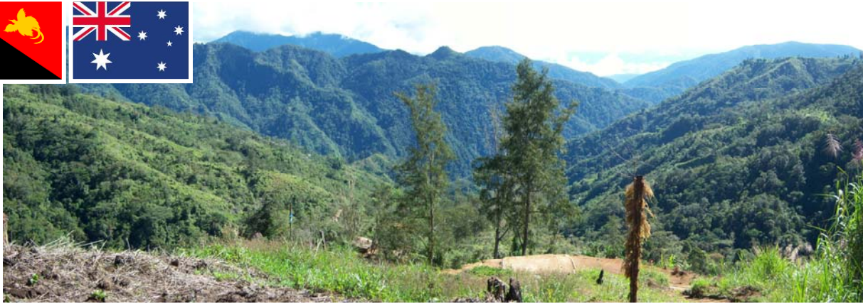
Kombruku Prospect – Yandera Copper – Molybdenum – Gold Project