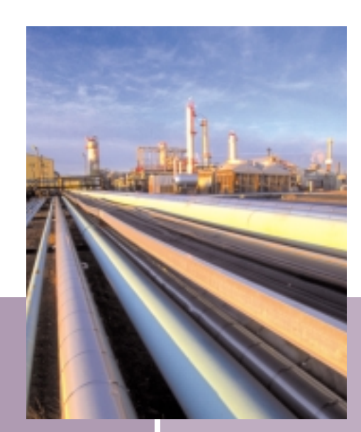
Husky's 1,900 kilometre pipeline system transports oil production from Alberta and Saskatchewan to the company's upgrading and refining operations in Lloydminster.