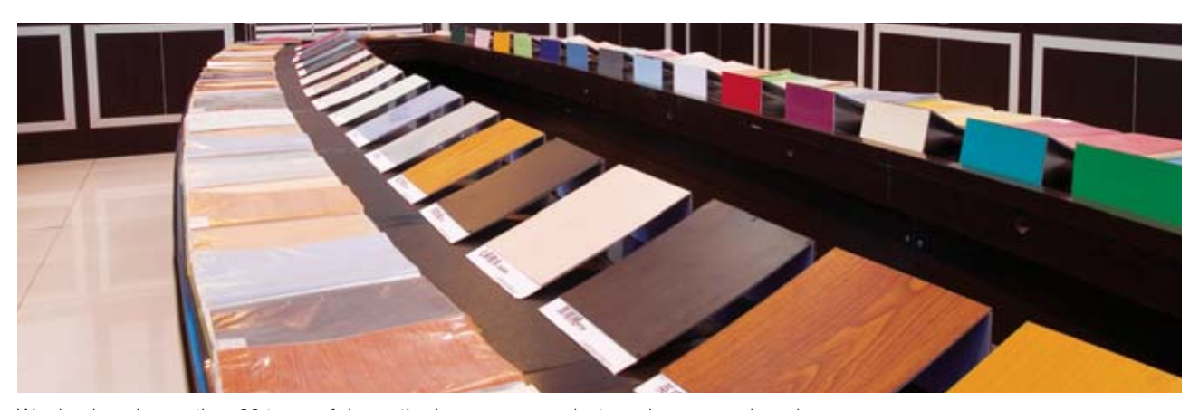
We developed more than 80 types of decorative base paper products under our own brandname. 本集團已開發逾80種自家品牌的裝飾原紙產品。

本集團相信,近年產能的上升使我們的市場地位得以加強,並提昇我們的市場競爭力。本集團計劃在未來繼續擴展產能,山東省輕工業辦公室於二零零七年一月批准此計劃作為人造板工業十一五規劃分析報告內中國造紙業獲批項目之一。因此,我們於二零零七年三月初開始商業生產。本集團亦已於二零零八年三月開始興建兩條新生產線(第8及第9號生產線),預期此兩條生產線將於二零零八年產竣工。此兩條新生產線各自的設計年度產能均為30,000噸。待第8及第9號生產線完成興建