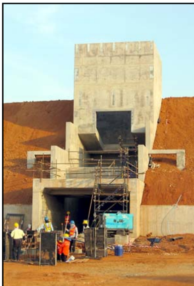
Primary Crusher (No.2) under construction

For the half year, unrealised non-cash foreign exchange losses on intercompany loans and costs associated with the two outstanding corporate transactions are expected to have an adverse impact of around A$13 million on the December 2010 half year profit.