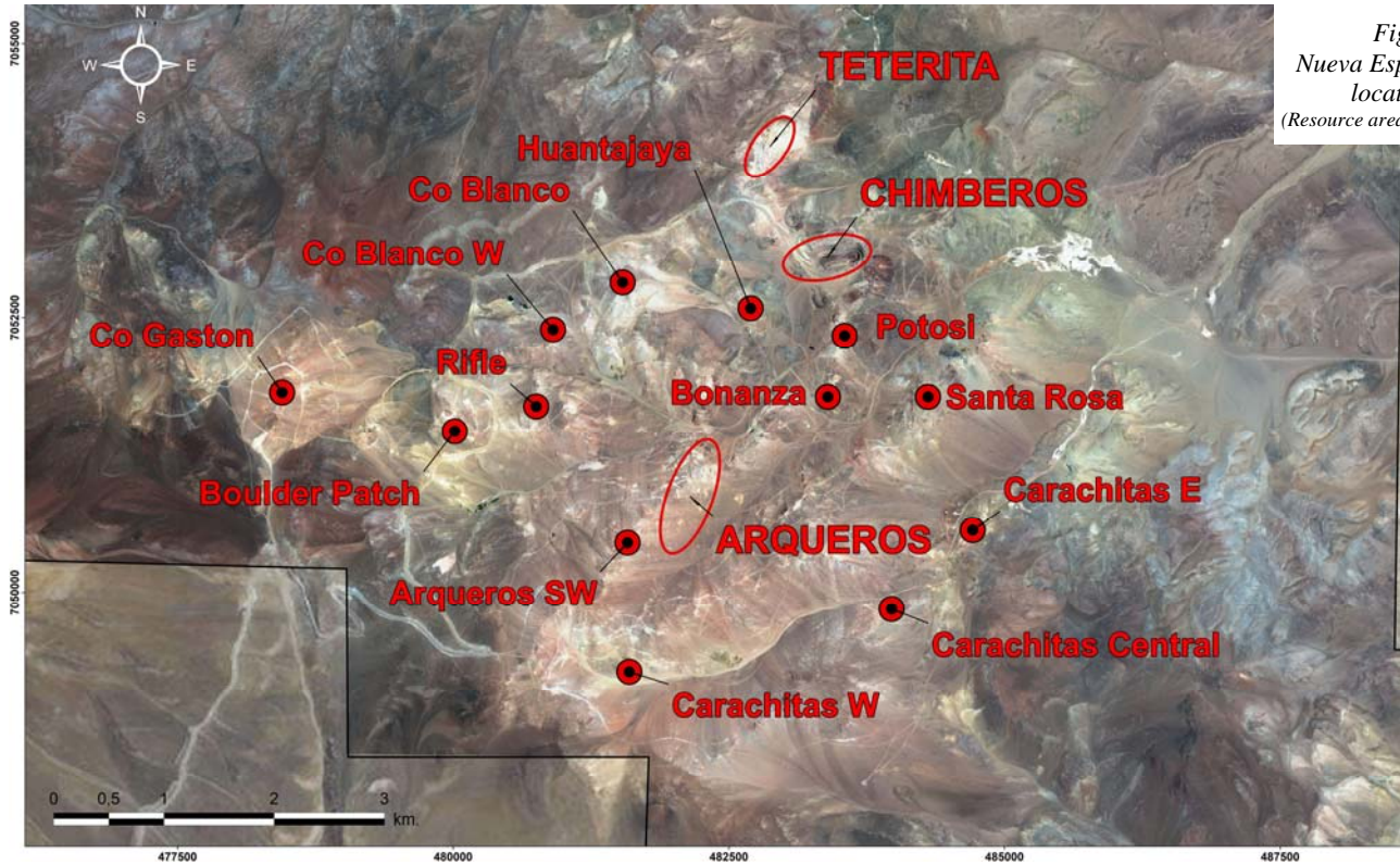
Figure 1: Nueva Esperanza target location map. (Resource areas in capital letters).