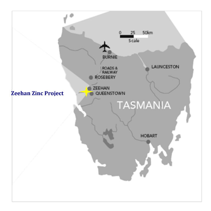
Figure 1 Location of Zeehan Zinc Project