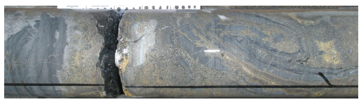
Figure 3 Drill core of zinc mineralisation from JB001

The Company had proposed to drill the 7km long Grunter copper zone within the drilling programme just completed. These drill holes have not been drilled, and 1000m of the announced 4,000m drill contract has been deferred to the next exploration programme.