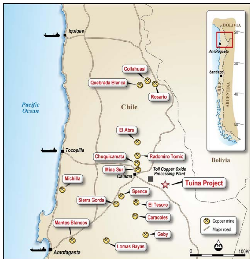
Figure 3 Location of Tuina Project