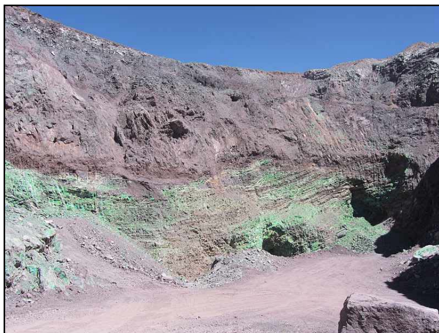
Figure 2 San Marcos copper oxide mineralisation