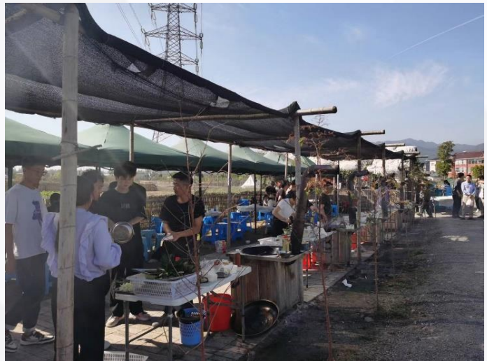
["Marching Forward Together Towards the Future" party building activity]