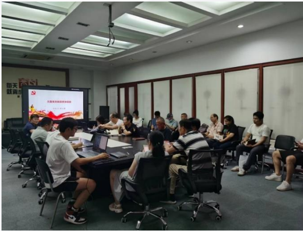
[Party Member Activity]