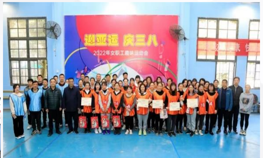
[Women's Day activities]