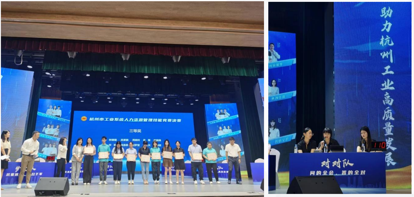
[Human Resource Management Skills Competition]