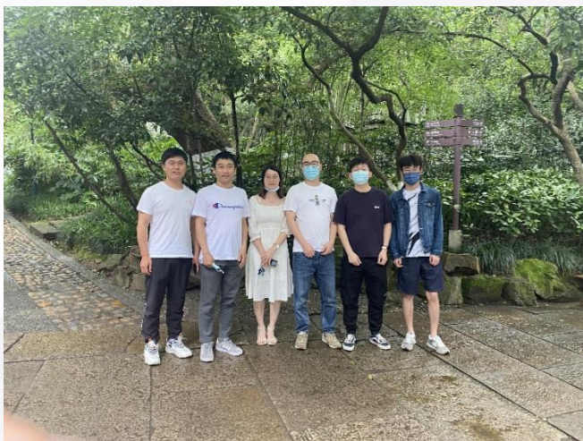
["Unite and Climb to the Summit" mountain climbing activity]