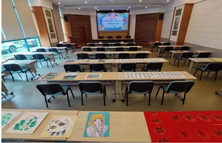
["Beautiful Home, Happy June 1" Painting and Calligraphy Competition]