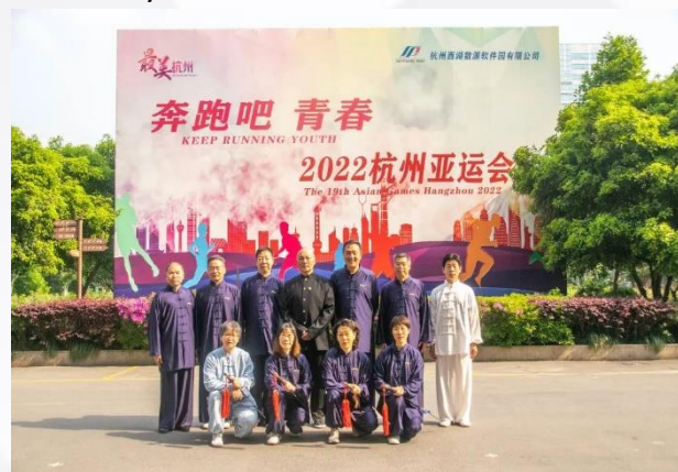
[Tai Chi Association]