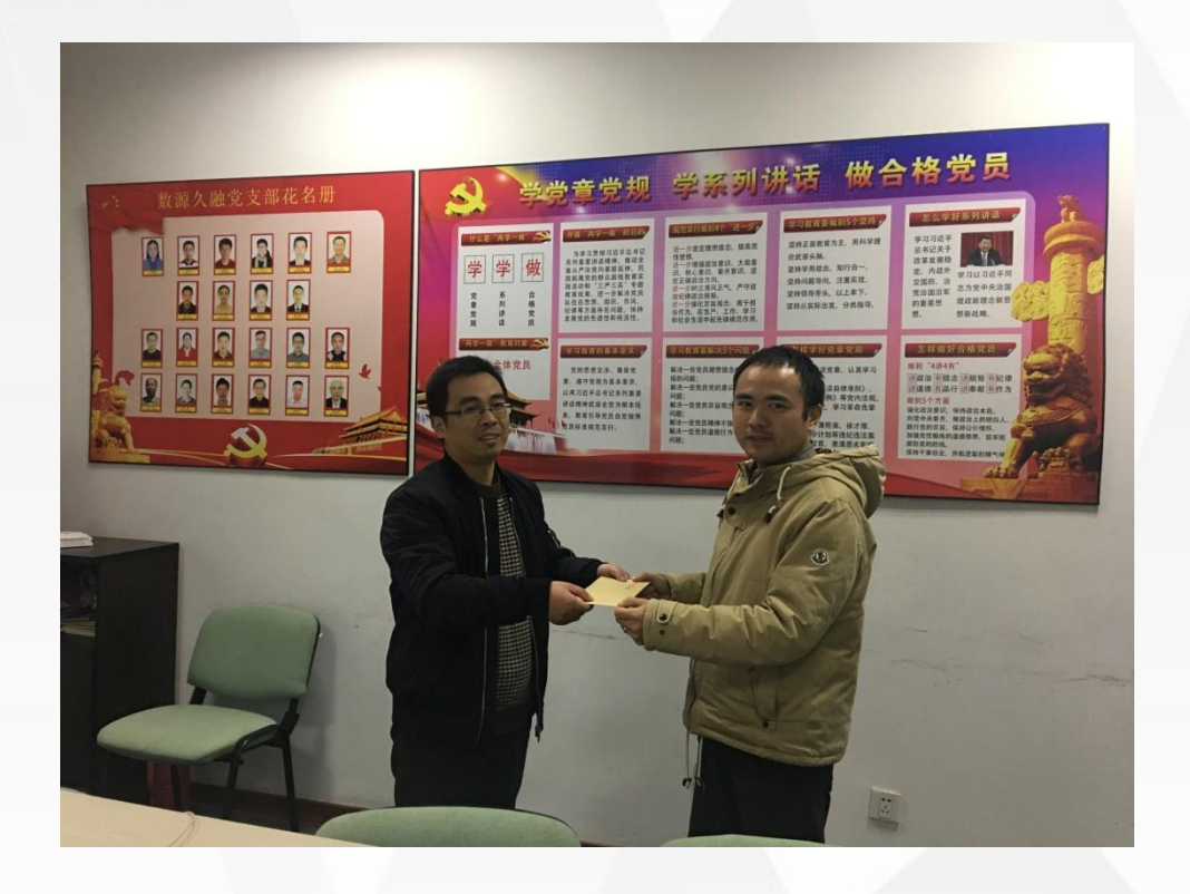
Donation to employees' families in difficulties