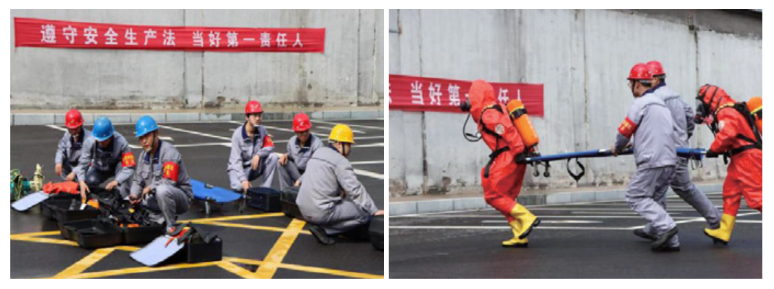
Safety, Health and Environment-related Drills

The Group entered into letters of responsibility for the targets of safety, health and environmental protection with project companies, and formulated the targets of safety production and occupational health supervision covering all employees and contractors. In 2022, the Group's overall annual safety, health and environment works were aimed at "no incident, no casualty, no pollution", including the goals of no fatal incidents, no serious casualties, no serious equipment safety incidents; no serious fire or explosion incidents; no serious environmental pollution incidents; 100% safety education and training; 100% special operations with permits; 100% passing rate of dangerous operation; 100% passing rate of work and operation; and no occupational patients. During the year, the Group carried out various activities in an orderly manner as planned, including works on fire prevention, special equipment and occupational health, as well as the orderly development of various training programs, such as occupational disease checkups, professional training and the provision of various types of labor protection products after considering and tackling the weaknesses of our own management.