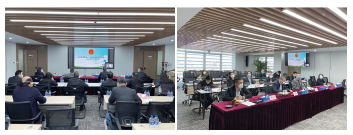
Reporting Seminar for Anti-Corruption Study

During the year, there was no case involving any violation of laws that have a significant impact on the Group relating to bribery, extortion, fraud and money laundering being brought against the Group or its staff.