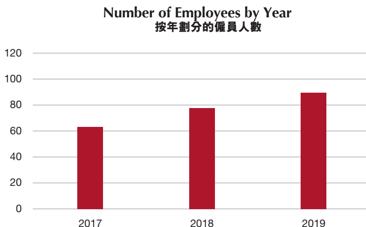
Figure 1 Total Workforce by Year

As of 31 December 2019, the Group had a total of 91 employees in its International Commerce Centre, Hong Kong and Shanghai offices. The number of employees increased by 17% as compared to the previous year. As the Sheung Shui office ceased operation in October, its number of employees is not included in the summary. See Figure 1 for the total workforce with yearly comparison, and Table 2 for the detail breakdown of the workforce.