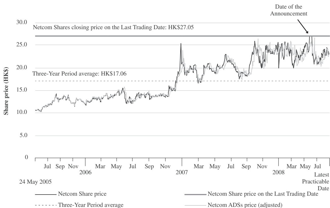
Chart 9 — Daily closing prices of the Netcom Shares and the Netcom ADSs

Chart 9 below shows the daily closing prices of the Netcom Shares and the Netcom ADSs from 24 May 2005 and up to and including the Latest Practicable Date.