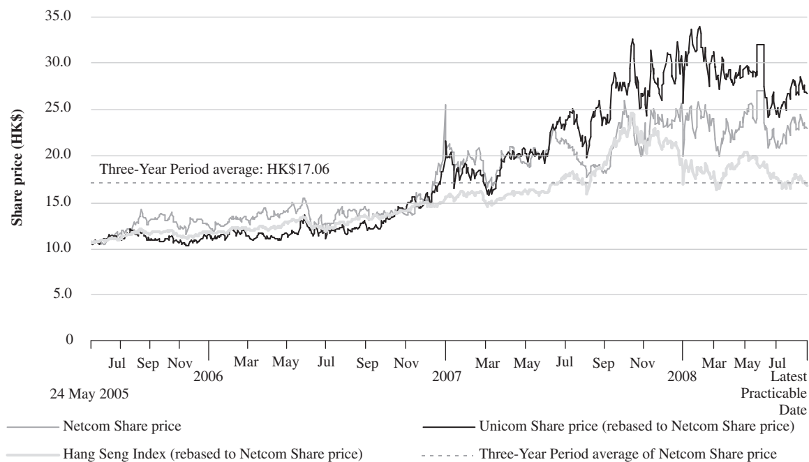
Chart 11 — Netcom Share price performance relative to the Unicom Shares and the Hang Seng Index

Chart 11 below shows the daily closing prices of the Netcom Shares relative to the Unicom Shares and the Hang Seng Index for the Three-Year Period and up to and including the Latest Practicable Date.