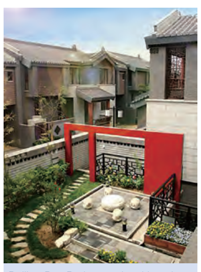
Beijing Bay Project - a local housing security system development project

The Group responds positively to the national strategy on addressing the housing needs of low-income group and contributes to the development of harmonious society. Over the past years, the Group has participated in the establishment of local housing security system during the development of its projects in cities such as Beijing and Anshan. For example, in order to resolve the housing problems faced by the families in Haidian District, Beijing,