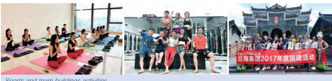
Sports and team buildings activities

The Group has established "Ordinary Management System for Staff" according to the related laws and regulations of the state. Permanent staff of the Group are entitled to paid holidays such as statutory holidays, annual leave, marital leave and maternity leave, family planning leave, breastfeeding leave and bereavement leave, etc.