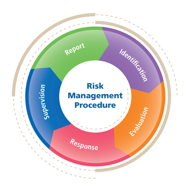
(Figure 1: Risk Management Procedures)