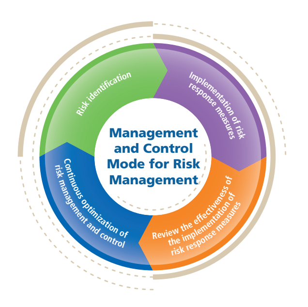
(Figure 2: Management and Control Mode for Risk Management)

During the Year, the management of the Group followed up on the implementation of the risk management improvement measures identified in prior year's risk assessment, as well as establishing a continuous risk management cycle which contains the process of "Risk assessment — Implementation the of the risk management procedures — Follow-up of the implementation of risk management measures — Risk management system ongoing monitoring" in order to ensure that the any risk management gaps are rectified and the ability to prevent and cope with risks is strengthened (for details, please refer to Figure 2: Risk assessment and management model).