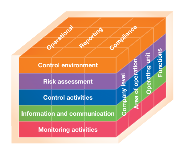
(Figure 3: COSO Internal Control — Integrated Framework)

China Evergrande Group has established its own internal control system by making reference to the internal control framework of the Committee of Sponsoring Organizations of the Treadway Commission (COSO) (please refer to figure 3: COSO Internal Control — Integrated Framework). The Group's risk management system consists of five interdependent elements, which coordinates with each other and operate to ensure the effectiveness of internal control functions of the Group. The five elements are: control environment, risk assessment, control activities, information and communication and monitoring activities.