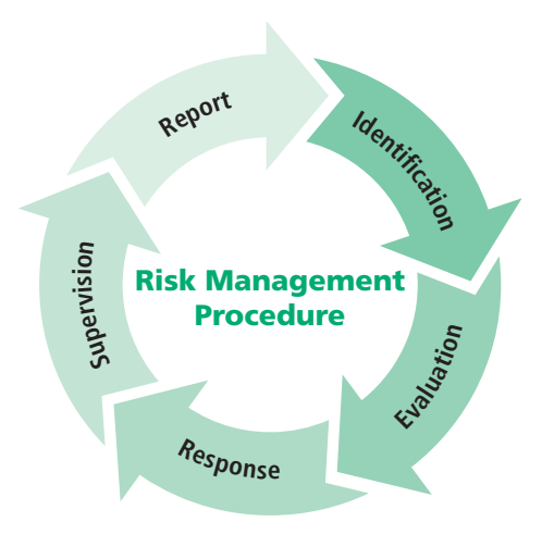
(Figure 1: Risk Management Procedures)

• Refined and reiterated the frequency of risk management review — The frequency of evaluation and report on risk management of the Group has been reiterated (at least once for every year). The aforesaid key elements standardized the format and frequency of report through the Company's risk management manual.