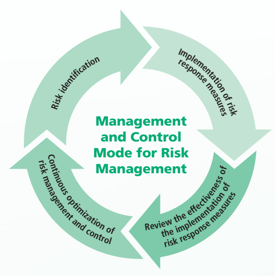
(Figure 2: Management and Control Mode for Risk Management)

During the Year, the management of the Group followed up on the implementation of the risk management improvement measures identified in prior year's risk assessment, as well as establishing a continuous risk management cycle which contains the process of "Risk assessment — Implementation the of the risk management procedures — Follow-up of the implementation of risk management measures — Risk management system ongoing monitoring" in order to ensure that the any risk management gaps are rectified and the ability to prevent and cope with risks is strengthened (for details, please refer to Figure 2: Risk assessment and management model).