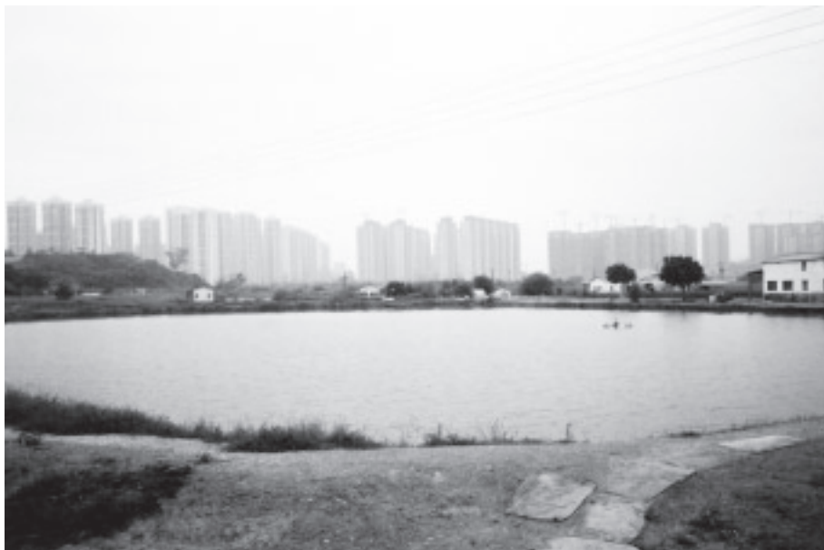
Kingswood Villas and nearby development