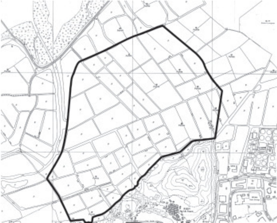
Appendix (ii): Outline Zoning Plan