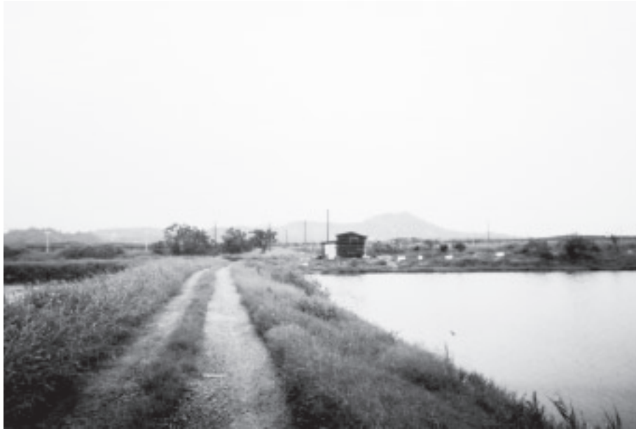
A view of the Property