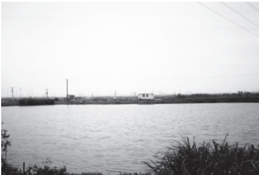
A view of the Property