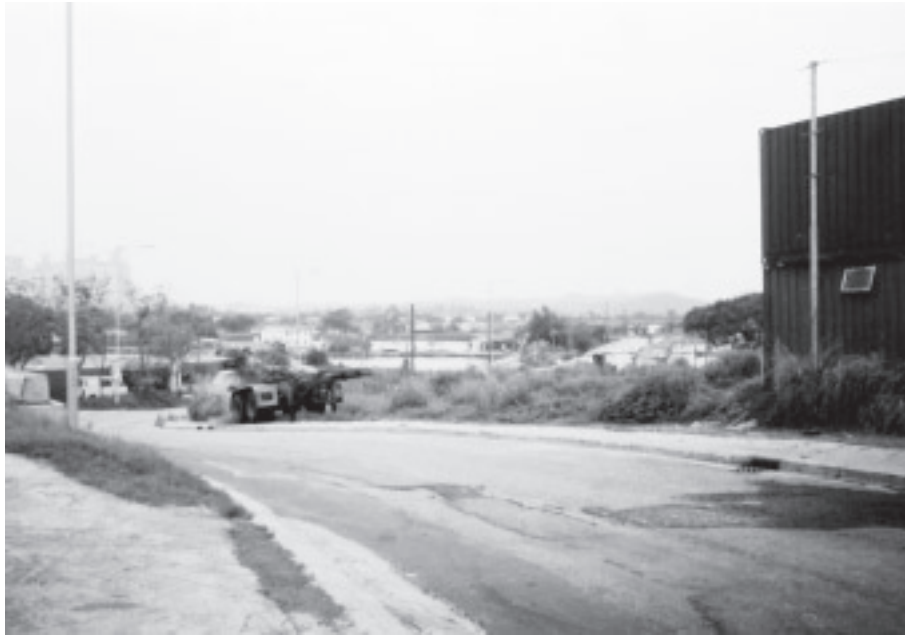
Access road branching off Fuk Shun Road