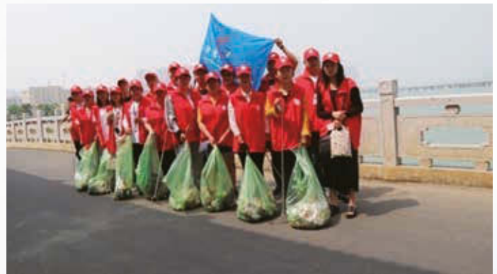
Volunteer environmental protection activities around Taihu Lake

The Caring Club of the Wujiang Production Plants regularly organise volunteer activities to protect Taihu Lake. On the day of the activity, employees brought friends and family members to pick up garbage around the lake. We also promoted environmental protection during the event to contribute to the ecological protection of the lake. In 2019, one of our volunteers won the honorary title of “Excellent Volunteer”.