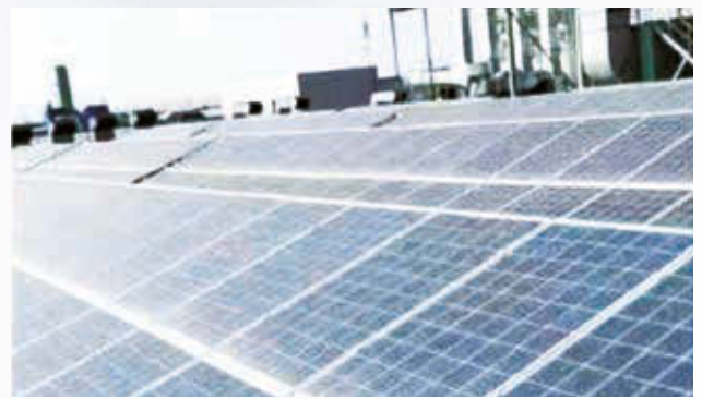
Rooftop of Compal Production Plant