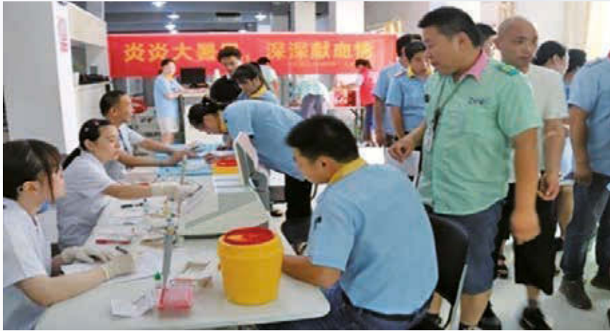
Caring blood donation week

Alongside the development, Ju Teng continues to fulfil corporate social responsibilities by actively organising community volunteer activities and charitable work to achieve harmonious and win-win development between the company and community. The Wujiang Production Plants encouraged employees to actively participate in blood donation activities. A total of 85 employees have participated, and 25,000 ml blood was donated. In addition, to create a clean, beautiful, civilised and orderly public environment for the surrounding communities of the Production Plants, we gathered employees to conduct “Clear Small Ads” volunteer services, which were praised by residents in the surrounding communities.