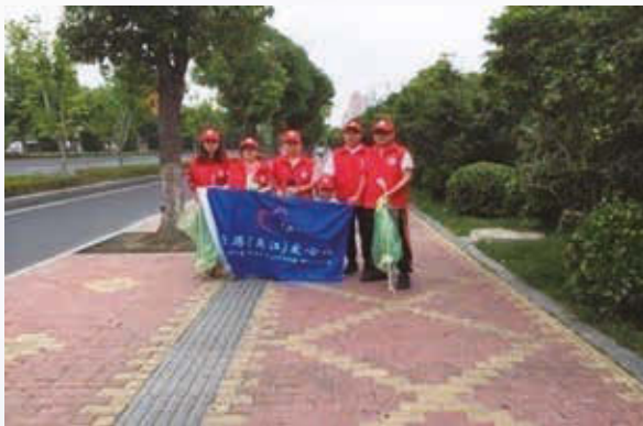
Caring Club environmental activities