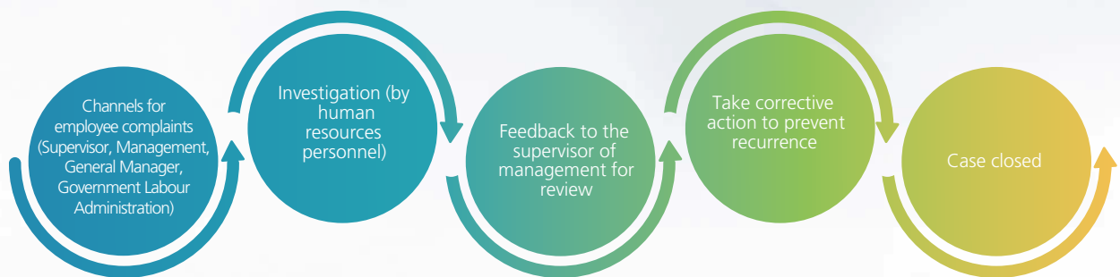
Employee appealing process

Unobstructed communication channels and sincere care are essential factors to create a harmonious labour relationship. The Group advocates open communication and has established a standardised, smooth and systematic communication mechanism. According to our “Employee Communication Management Procedures”, employees can make requests to department heads or the human resources department through SMS, phone, interview, company WeChat platform, company suggestion box and other channels. Employees are also free to decide whether to retain personal information during consultation, suggestions, coordination, appeals, and reports. The Group protects the confidentiality and anonymity of personal information of all employees, allows employees to freely communicate relevant opinions, and promotes the effective operation of the employee communication mechanisms.