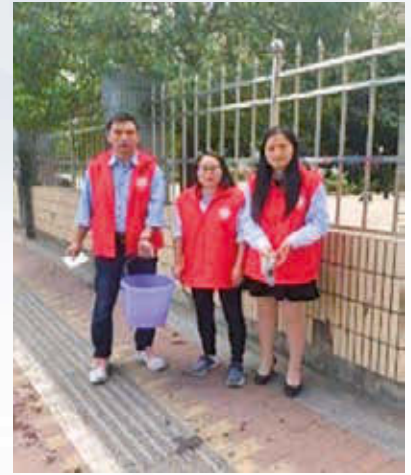
Community “Clear Small Ads” volunteer services