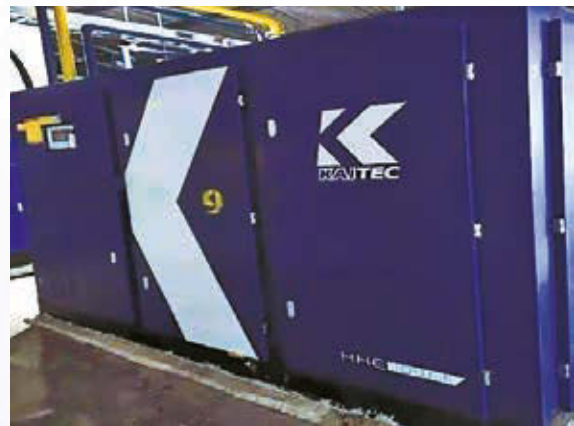
Renovated Air Compressor