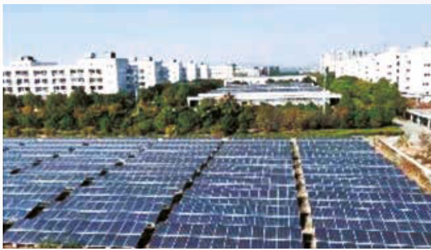
Vacant land of Compal Production Plant