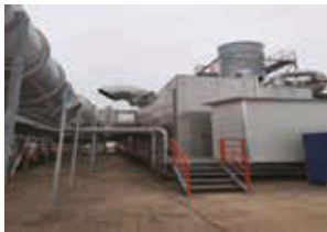
Installation of "zeolite rotor + RTO"