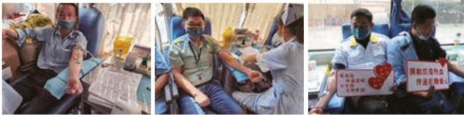
Blood donation during the epidemic

In the future, Ju Teng International will continue to pay attention to the development of the community, make more investments in the community, and focus on the common development of Ju Teng and the community where we operate.