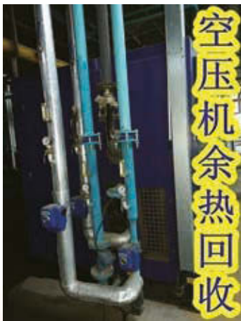
Air compressor residual heat recovery unit

During the Reporting Period, both the Compal Production Plant and the Neijiang Production Plant have adopted the residual heat recovery unit of air compressor to heat domestic water and reduce the consumption of electricity and energy. The residual heat recovery of the Compal Production Plant was 1,286.28 MJ, replacing 37.6 tons of coal equivalent; the Neijiang Production Plant added two 315KW air compressor residual heat recovery units; it is estimated that 1,820 MWh of purchased electricity are saved in the year. In addition, 13 sets of 75KW air compressors were eliminated from the Neijiang Production Plant, saving 2,120 MWh of purchased electricity for the whole year.