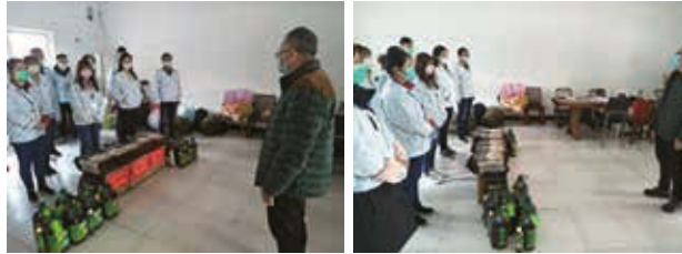
Providing materials for the frontline anti-epidemic staff in February 2020

Faced with the epidemic in 2020, Ju Teng International took social responsibilities and provided materials for the frontline anti-epidemic personnel of the Group. At the same time, in the case of insufficient blood collection during the epidemic, employees donated blood for three times in May, June and December respectively, and took their practical actions to help fight against the epidemic. More than 190 employees joined the blood donation team in the Wujiang Production Plants alone, and the blood donation amount reached 60,000 ml.