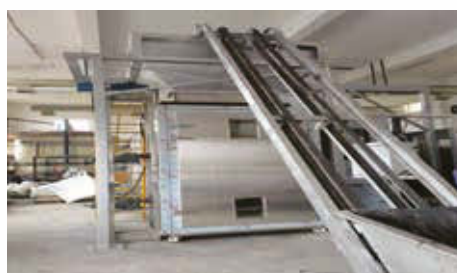
Sludge drying device

The Group's greenhouse gas, sewage and waste emissions are as follows: