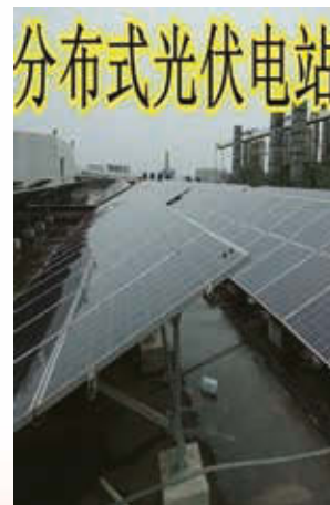
Distributed photovoltaic power plant

Ju Teng International always encourages each Production Plant to fully utilise its own advantages and resources to develop and build new energy projects such as photovoltaic power generation. During the Reporting Period, the Compal Production Plant continued to utilise the unused vacant land and roof of the plant for photovoltaic power generation. In 2020, 12,130 MWh of photovoltaic power was generated, saving 1,491 tons of coal equivalent. Compared with previous years, photovoltaic power generation increased by 13%, and coal equivalent saving increased by 13%. Clean electricity produced by photovoltaic power plants was used for the Company's production and operation, which reduces the purchased electricity and indirectly reduces the greenhouse gas emissions caused by thermal power generation.