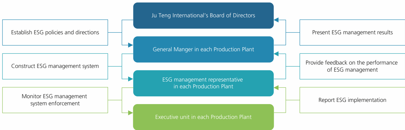
ESG Management Organisation Structure

The Board of Directors of Ju Teng International is taking the lead in formulating ESG management policies at the Group level. The general manager of each production plant company (“Production Plant”) is responsible for constructing the ESG management system that meets the characteristics of the Production Plant, participating in the top-level design, controlling the policies and systems of all ESG aspects, and reporting to the Board of Directors the Production Plant’s ESG management results. Each operational unit in the Production Plants is required to strictly implement the ESG management system, including executing the ESG targets, ESG training, managing ESG-related data and collecting information. The Group’s ESG management organisation structure is as follows: