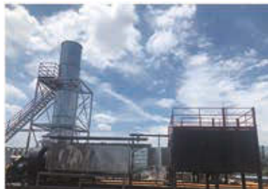
VOCs treatment process