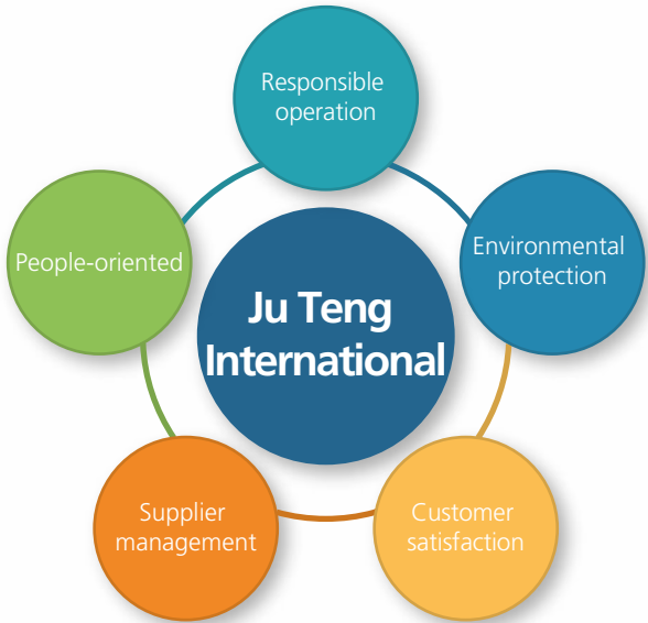
Ju Teng International’s visions

Ju Teng always believes that quality, scientific management and sustainable development are the foundation. With the increasingly stringent requirements of governments and markets on the electronics industry’s production chain over the past 20 years, we have won the recognition of our customers worldwide by relying on our advanced technologies, responsible attitude, professional services and excellent product quality. We are well aware that a well-performing enterprise not only delivers high-quality products but also conducts scientific management and achieves sustainable development. With a view to performing the social responsibilities, promoting the progression of our suppliers and protecting the benefits of our broad investors, we promote the sustainable development of the electronics industry through our endeavours in the following five vision areas.