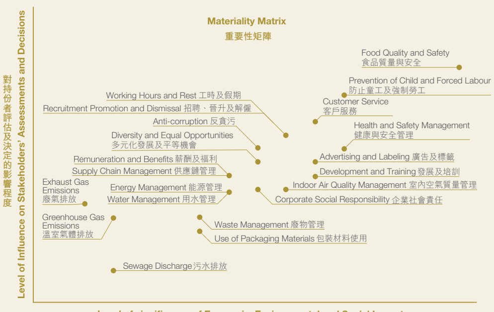
Level of significance of Economic, Environmental and Social Impacts 對經濟、環境及社會影響的重要性程度

本集團主要職能的管理層及僱員均已參與 編撰本報告,以協助本集團審查其業務營運, 識別相關環境、社會及管治事宜,並評估該 等相關事宜對我們業務及持份者的重要性。 我們根據已識別的重大環境、社會及管治 事宜編製資料問卷,向本集團的相關部門、 業務單位及持份者收集資料。下列矩陣概 述本集團的重大環境、社會及管治事宜。