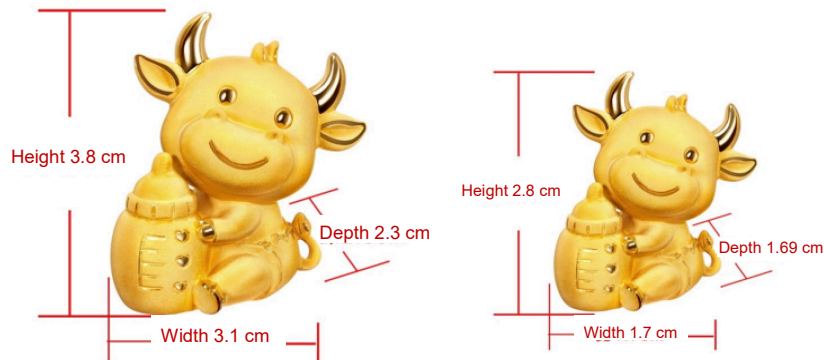
Volume Comparison of Same-weight Gold

Traditional Electroformed Gold Ornament (gold weight: approx. 1.6g) Volume: 4.5cm 3