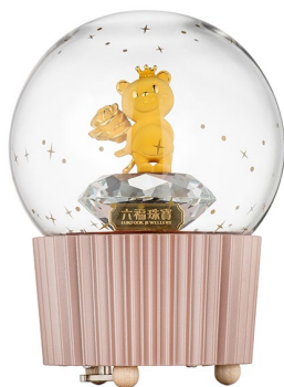
Bear Love Statement