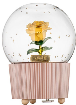
Love Blooming Rose