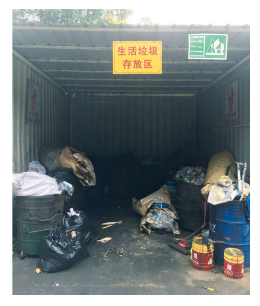
Household trash area in a factory

The Group has formulated and implemented the "Waste Management Procedures". By separating, collecting and treating production and domestic solid wastes, it is ensured that the wastes produced by the Group will not pollute the environment and will comply with the Group's environmental policy as well as local laws and regulations. Hazardous wastes and non-recyclable industrial wastes are passed by the management department to state-recognized and qualified waste disposal organizations for treatment.