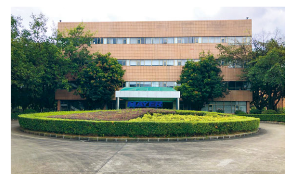
Green environment in production area

The Group's premises have been designed as a green production area, where arbors and shrubs are continuously planted, totaling 315 trees of 13 species including lychee trees, longan trees, mango trees, pine trees and so forth.