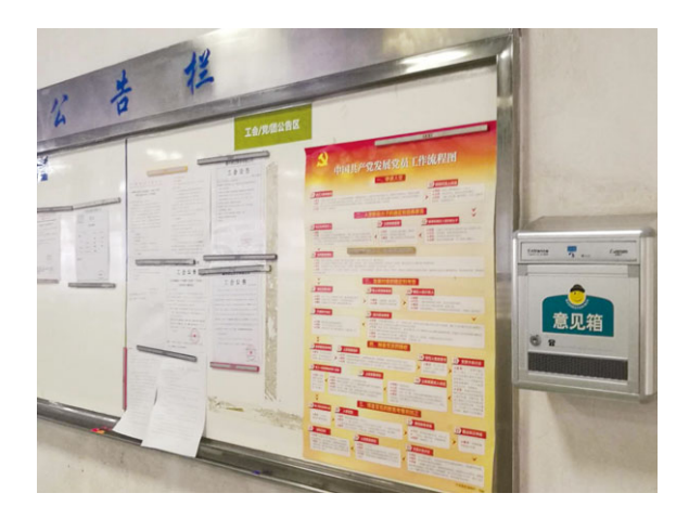
Suggestion box located in the office building

Regarding corruption, fraud or practices harming the interests of the Group, if it is reported or prevented beforehand, and thus prevent the Group from suffering material loss, a top-level merit will be recorded for the employee.