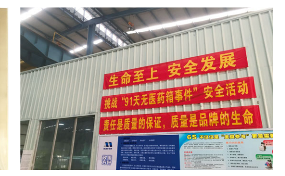
Slogan for Safety Management

Participation of Guangzhou Mayer's staff members in the annual fire drill on 4 December 2017