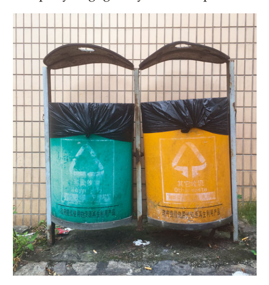
Waste separation facilities separating a production workshop

Waste separation facilities with "Recyclable", "Non-recyclable" and "Hazardous" classifications are set by Guangzhou Mayer to encourage residents and employees to develop green living habits. Hazardous wastes are collected and treated by a qualified company engaged by the Group.