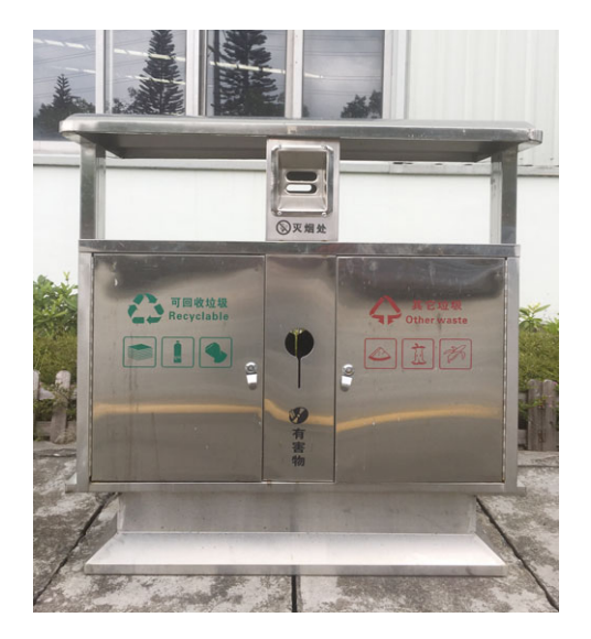
Waste separation facilities with recyclable and non-recyclable wastes in recyclable, non-recyclable and hazardous classifications in factory area