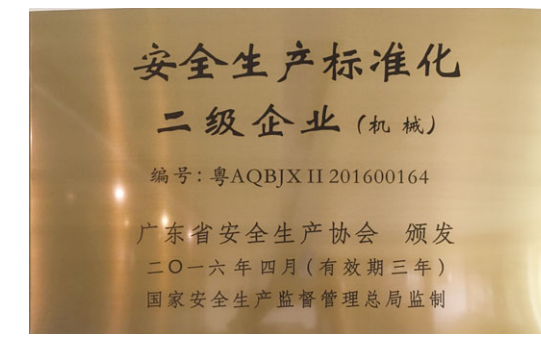
"Class-II Enterprise for Production Safety Standardization (Machinery)", which is valid for three years, awarded by Guangdong Provincial Association of Work Safety in Year 2016

Participation of Guangzhou Mayer's staff members in the annual fire drill on 4 December 2017