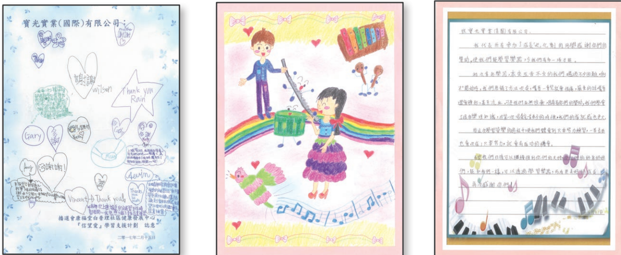
Thank you cards designed by primary school students 由小學生親自設計的感謝帖

Our volunteer team has grown in size and experience with repeat volunteers and new volunteers joining in the activities.