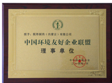
Governing Unit of China Environmental Friendly Enterprise Alliance