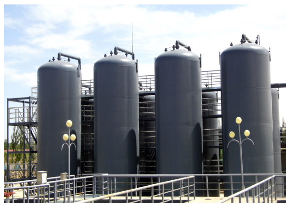
Waste gas treatment facility

There are two kinds of waste gas produced by the Company, including technology gas and boiler flue gas. Technology gas treatment: The Company uses a variety of technologies for treating the organic waste gas which was produced in the process of production, and related technologies comprise the double or multiple combinations of activated carbon and activated carbon fiber adsorption, alkali spray, low temperature plasma, catalytic oxidation and so on. For odor gas which was produced in the process of wastewater treatment, we use the technology of “alkali spray + ozone oxidation”. Boiler flue gas treatment: The dust and sulfur dioxide in boiler flue gas was treated by the technology of “(spraying calcium inside the furnace) + SNCR + cloth bag dusting + limestone-gypsum desulfurization”.