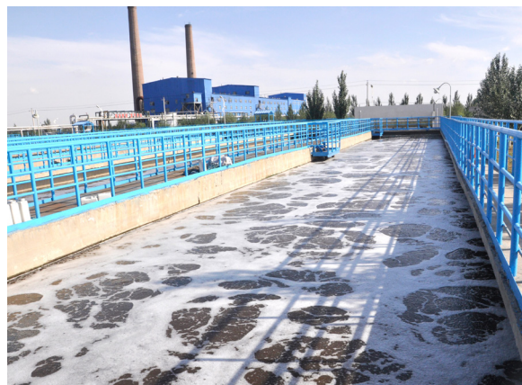
Wastewater treatment facility

The Company has built three sets of independent wastewater treatment system, combining biochemical, physicochemical, aerobic and anaerobic as a whole. Wastewater is treated with the “preprocessing – hydrolytic acidification - Upflow Anaerobic Sludge Blanket (UASB) – Cyclic Activated Sludge System (CASS) –catalytic oxidation – secondary sedimentation tank” procedure, equipped with relevant technical staff and assisted with contingency plans and management systems to ensure to the utmost extent the functioning of wastewater treatment facility and up-to-standard wastewater discharge. At the same time, the Company invested in and set up COD (chemical oxygen demand) and \text{NH}_3\text{-N} (ammonia nitrogen) online monitoring system which accorded with relevant national standards, at the total outfall of wastewater. The system is interconnected with the urban environmental information monitoring center and achieved real-time data transmission. In addition, the online monitoring data and monitoring and inspection data conducted by the Company itself will be published at specified information platform on time.