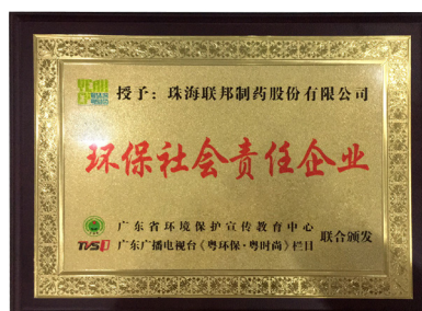
Environmental Protection Social Responsibility Enterprises