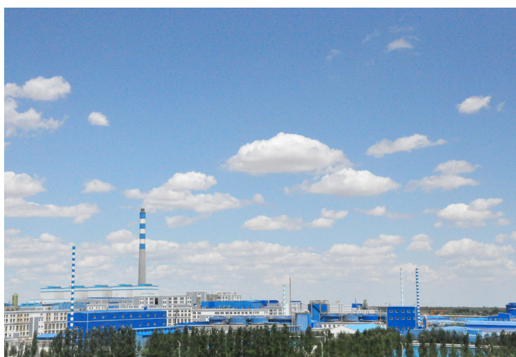
The plant of The United Laboratories (Inner Mongolia)

crystallization mother liquor MVR system and waste acid water MVR system. The technology can greatly reduce the emission of COD (chemical oxygen demand) and ammonia nitrogen into the water. The wastewater, with reaching the standards after testing, will be discharged to the local wastewater treatment plant for reprocessing and the wastewater will be reused once reaching the recycling standard. We strive to reduce the waste of water resources by strengthening the water reuse and reducing the use of the one-time water.