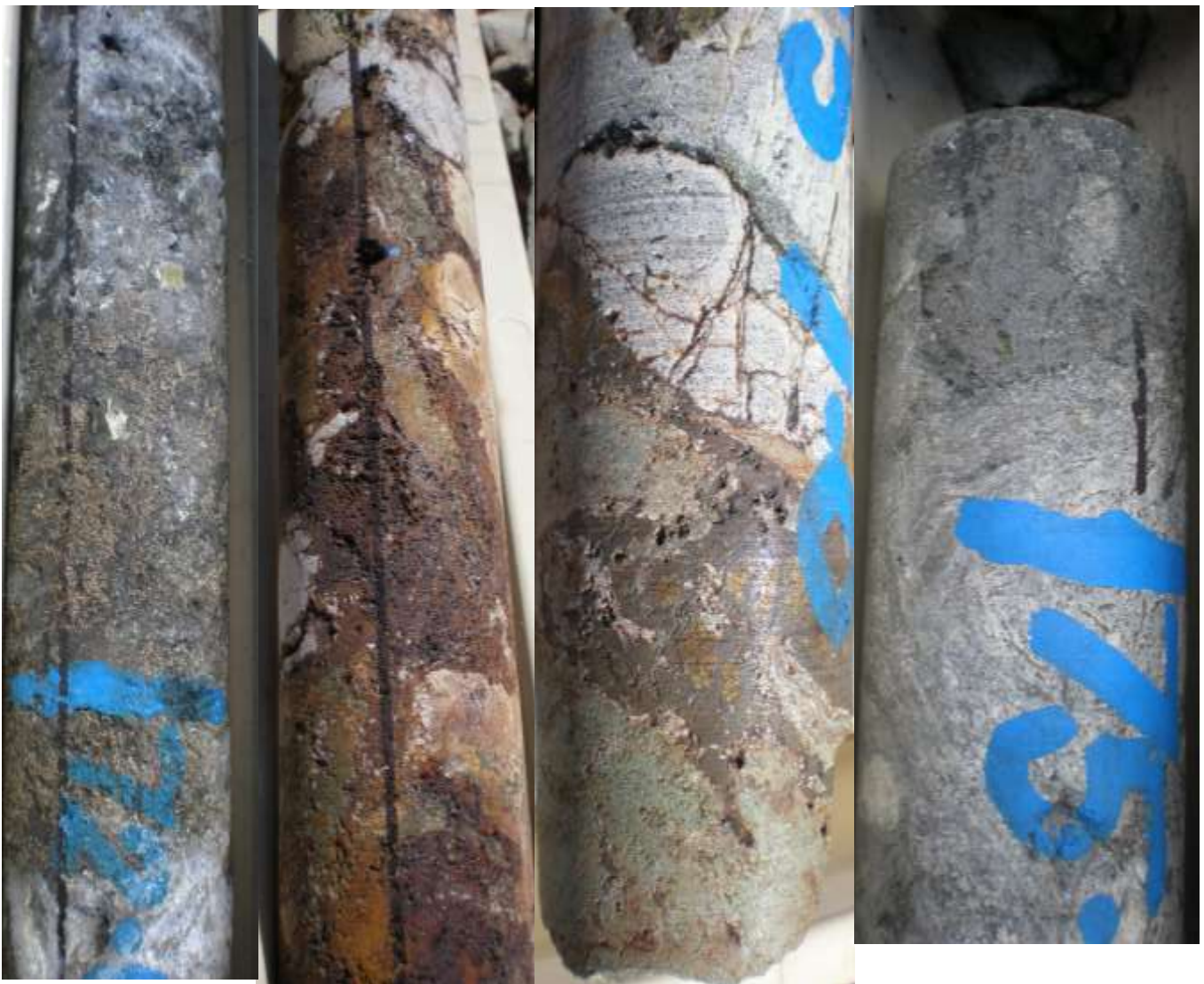
Figure 2a. Nickel and iron sulphides.

The veins and breccias are interpreted to dip steeply to the south and occur within metasedimentary rocks beneath a thin unit of shallow dipping ultramafic rock that forms part of the Red Hill intrusion (Figure 3).