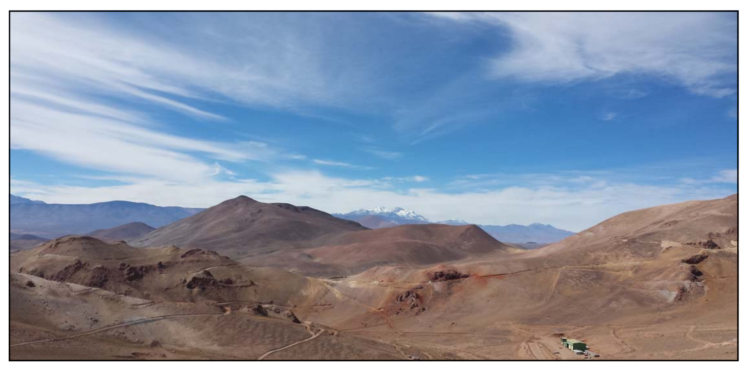
Kingsgate Consolidated Limited - Quarterly Report for the three months ended 30 September 2017

It is with great sadness that King Bhumibol Adulyadei of Thailand (also known as King Bhumibol the Great, and King Rama IX as the ninth monarch of the Chakri Dynasty) passed away at the age of 88, on 13 October 2016, after a long illness. A year-long period of mourning was subsequently announced and, on 26 October 2017, the cremation was held at the public square, Sanam Luang. Thence followed a five-day Royal Cremation Ceremony, until the end of October, after which the King's ashes are to be taken to the Grand Palace and later enshrined at two Buddhist temples in Bangkok. The late King Bhumibol is remembered as a good friend of Australia and will be greatly missed. The coronation of Thailand's new King Maha Vajiralongkorn (King Rama X) is likely to take place at the end of this year, and both Kingsgate and Akara Resources wish him a long and peaceful reign.