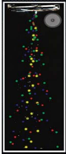
Digitised photo of droplets of encapsulated cells

We have always known that there is tremendous value in the broad applicability of our technology. Through licensing, we create a consistent revenue stream into the company and the potential for further agreements to be reached with therapeutic and research based companies. The financial benefits of such collaborations would not only be used towards our ongoing clinical trials, but they would also be passed on to our shareholders.