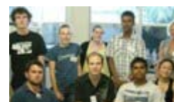
Images from the Rotary Event (see item left)