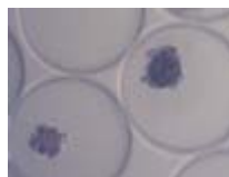
Viable islets in capsules