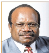
Sir Rabbie Namaliu Non-Executive Director