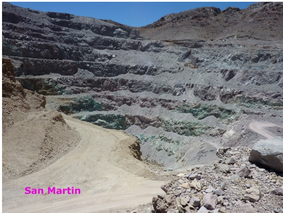
Figure 3 San Martin oxide copper open pit

Figure 3 is one example of an oxide copper pit that has the potential to be expanded.