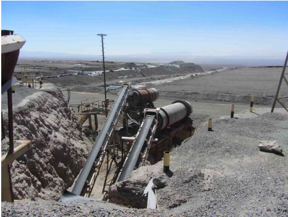
Figure 4 An abandoned copper oxide plant at Tuina The equipment shown is not currently an asset of RMG