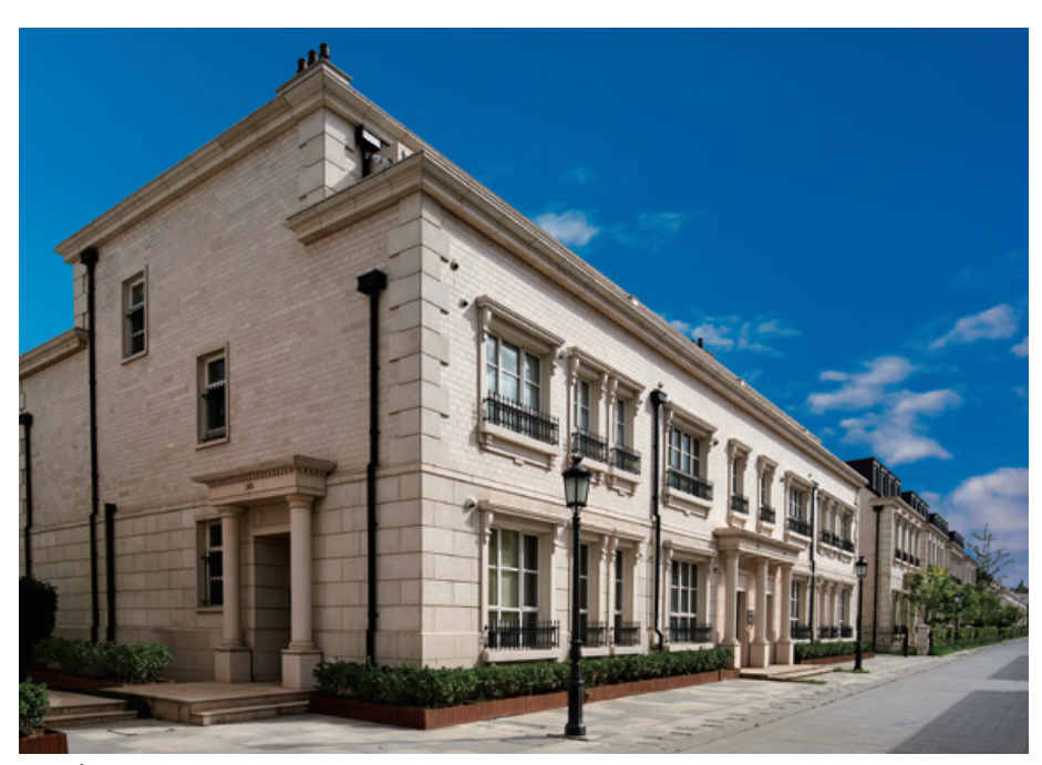
Queen's Gate in Shanghai

The Group's development pipeline continues to progress during the year with 3 joint venture real estate developments ready for launch in the coming financial year. In Tongzhou Beijing, the 2.3 million sq. ft. GFA waterfront commercial/residential joint venture development is in foundation stage and had completed the construction of its sales & experience center. We expect to obtain the presale consent of the development shortly and will commence sales in second half 2019. In Shanghai, the Group had obtained presales consent of the third phase of the completed Queen's Gate, a luxurious villas and apartments development in Hongqiao Shanghai. The Group also expects to commence its sales effort in second half 2019. In Hong Kong, marketing efforts of the ultra-luxurious residential development Dukes Place in Jardine's Lookout has commenced and the Group expects favorable returns from this project.