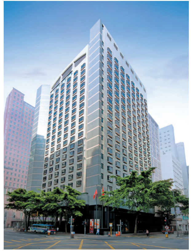
Empire Hotel, Wanchai