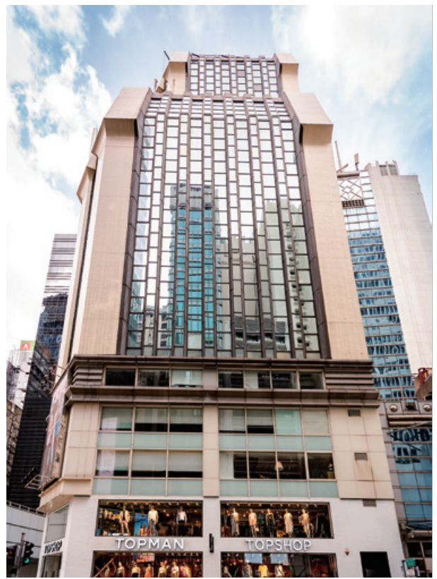
Asia Standard Tower, Central

In August 2018, a 25% joint venture of Asia Standard International group completed the acquisition of Octa Tower, a commercial building in Kowloon Bay of approximately 800,000 sq. ft. marketable GFA. The commercial asset is being repositioned with an introduction of a major multi-national corporation ("MNC") as an anchor tenant and renovation of its common areas had just commenced and is expected to be completed by June 2020.