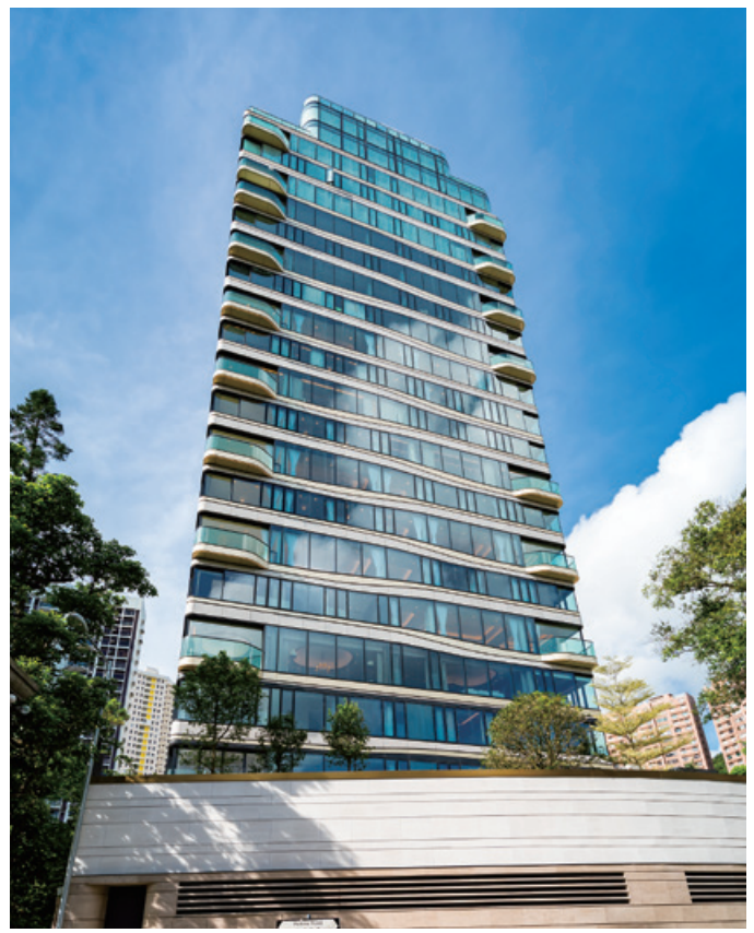
Dukes Place at Perkins Road, Jardine's Lookout

Through Asia Standard International group, its 51.8% owned listed subsidiary, the Group continued its main business of property development, sales and leasing operation.