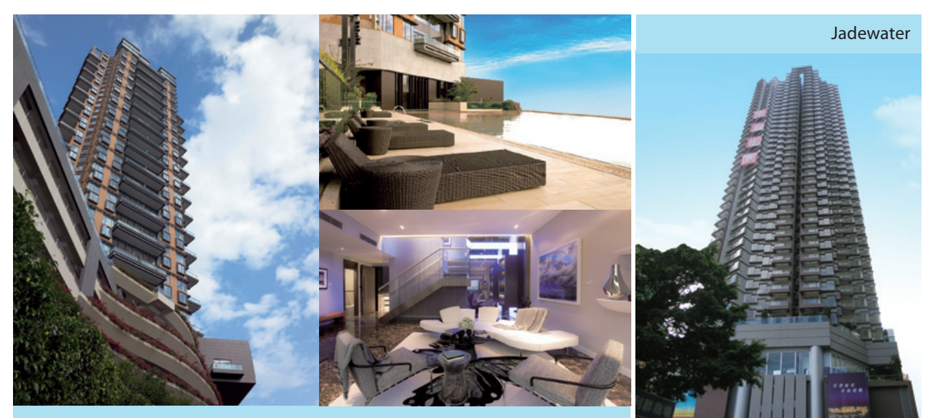
The Westminster Terrace