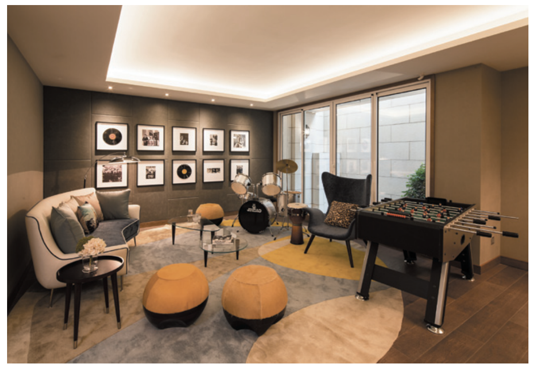
Queen's Gate in Shanghai