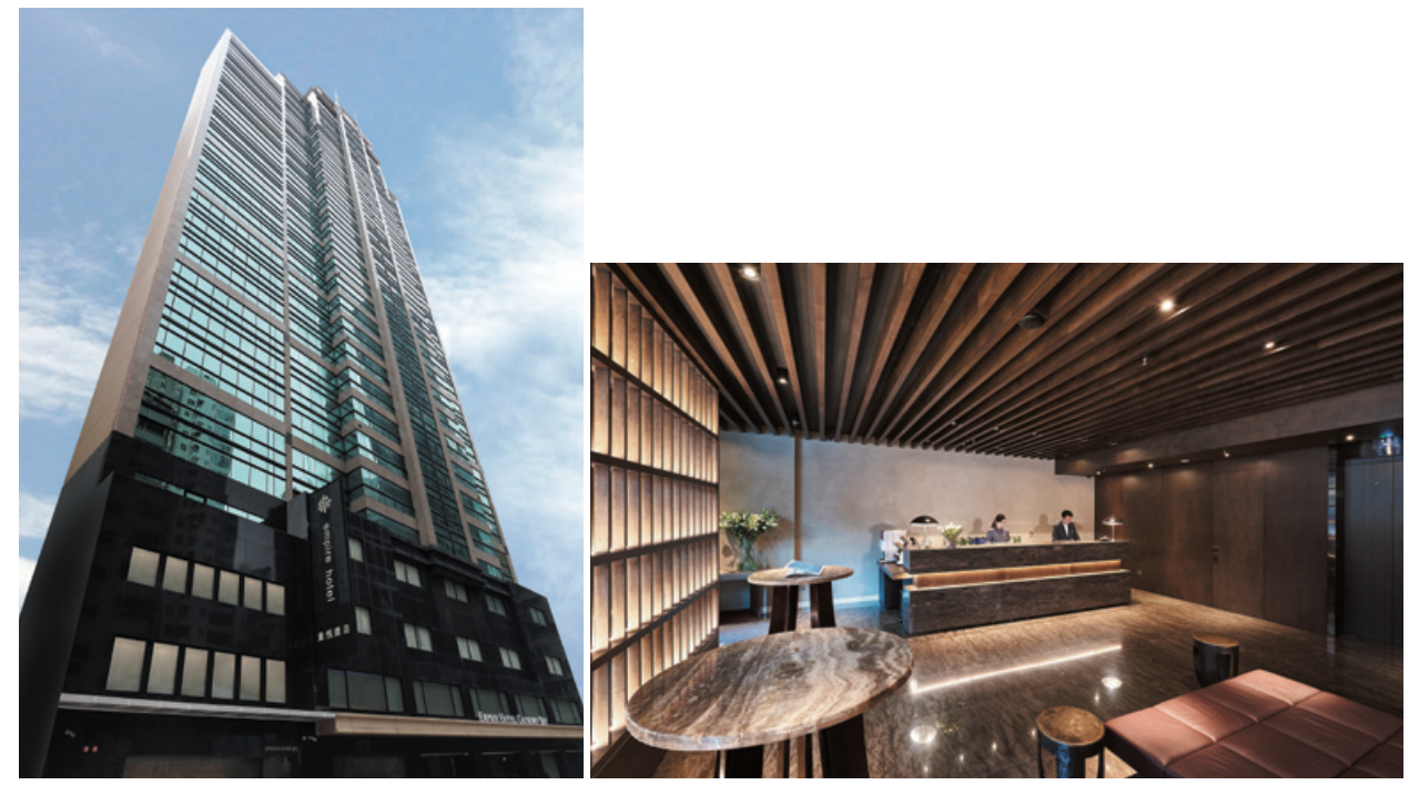
The newly opened Empire Prestige and the adjacent Empire Hotel Causeway Bay