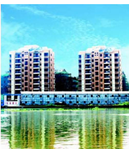
City Green Garden