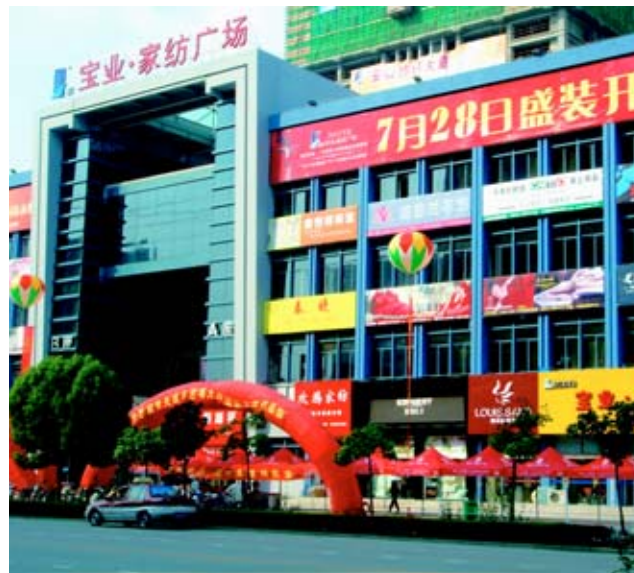
Baoye Four Seasons Garden