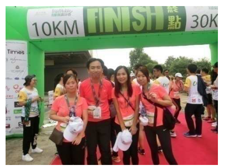
Trail Hiker 2016 in October