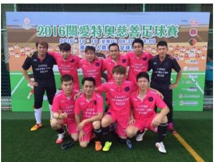
Special Olympic Soccer Match in October