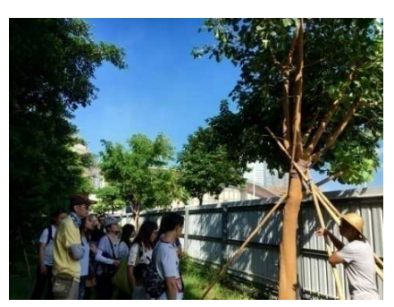
Ecological Zones of Macau Tour in September