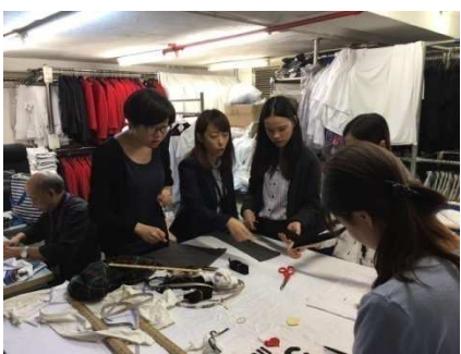
DIY Recycle Bag Workshop in August