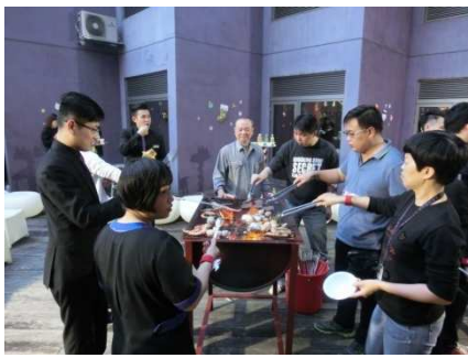
Annual Barbecue in December