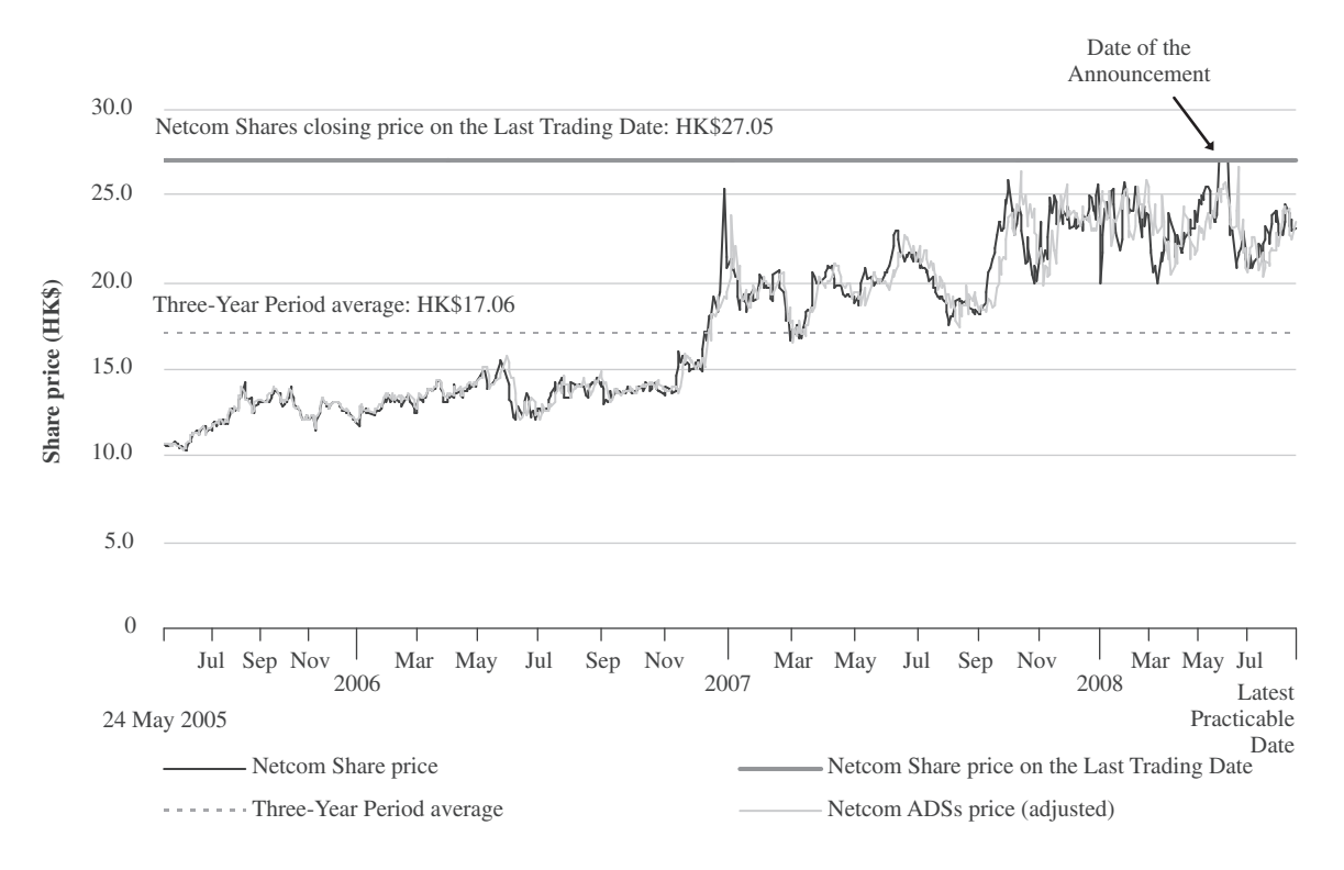
Chart 9 — Daily closing prices of the Netcom Shares and the Netcom ADSs

Chart 9 below shows the daily closing prices of the Netcom Shares and the Netcom ADSs from 24 May 2005 and up to and including the Latest Practicable Date.