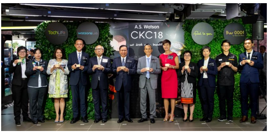
Photo 3: Officiating guests and store managers toast the grand opening of CKC18 with Sake